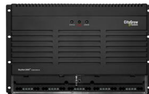
SkyNET 2000 Main Unit

Standard color of button and frame available for purchase