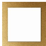
CG110-PF-GD Champagne gold Frame