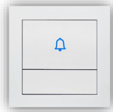
CG100HHB-SKY Doorbell Switch