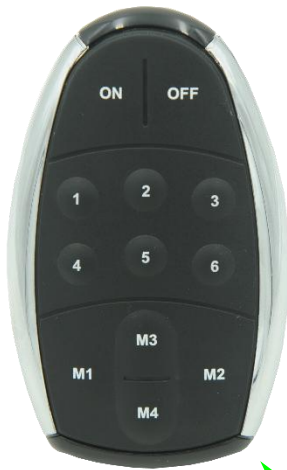
CG102RV3 ZigBee Remote