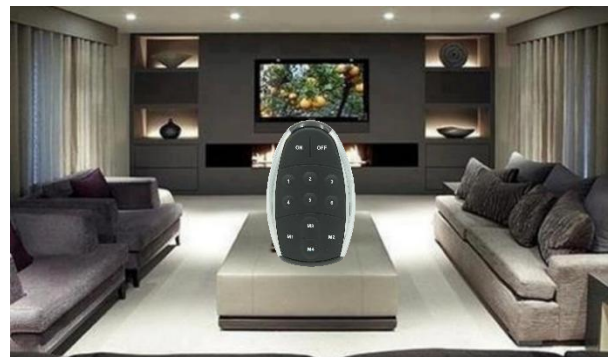
Lighting scenes, All off, Good night, Goodbye, Day mode, Night mode, Eco mode and..... all your dream come true !