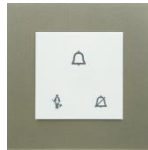
CG800HHB Doorbell Switch With DND / Clean (for Hotel)