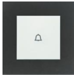
CG800HHB Doorbell Switch