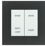
CG800H2-MD Scene Control Panel, 4 Scenes