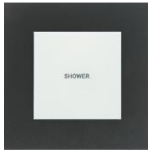
CG800H1-MD Scene Control Panel, 1 Scene