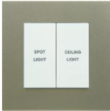
CG800S2 Two Gang Switch