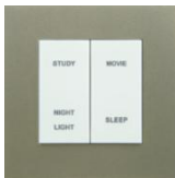
CG800S4 4 Gang Switch