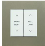
CG800DM2 Two Gang Dimmer