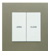
CG800S2-CCP 1 Gang Curtain Control Switch