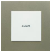
CG800S1 One Gang Switch