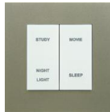
CG800S1H2 Scene Control Panel