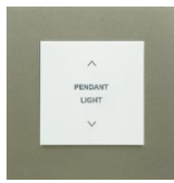
CG800DM One Gang Dimmer