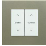
CG800S4-CCP 2 Gang Curtain Control Switch