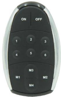
CG102RV3 ZigBee Remote